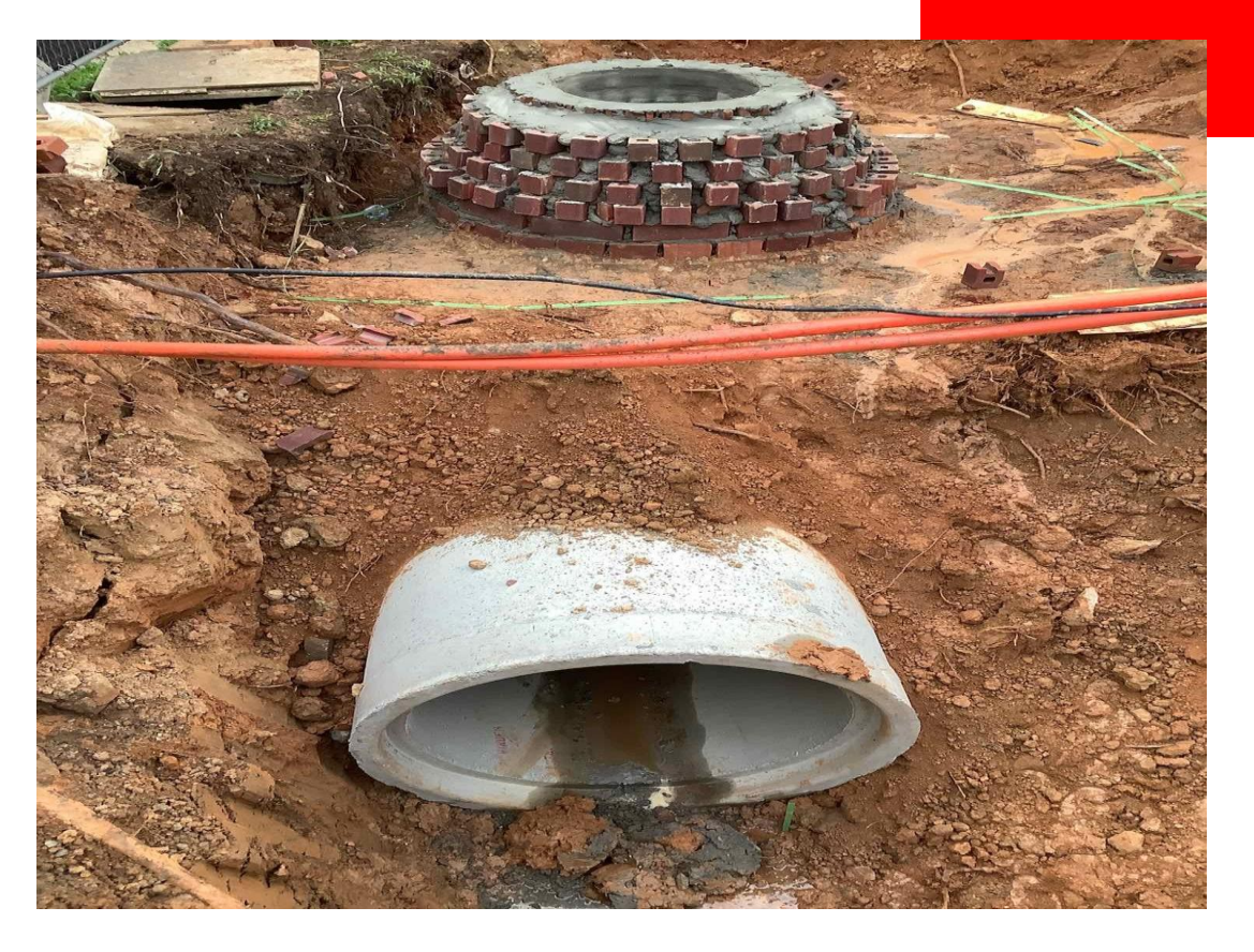
Site storm drainage piping and structures